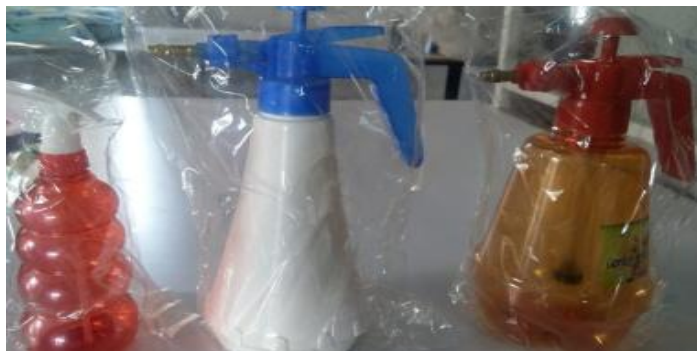
Spray Pump (400ML, 1 Ltr, 2 Ltr)