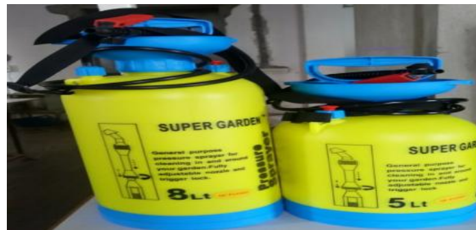
Spray Pump (5 Ltr, 8 Ltr)