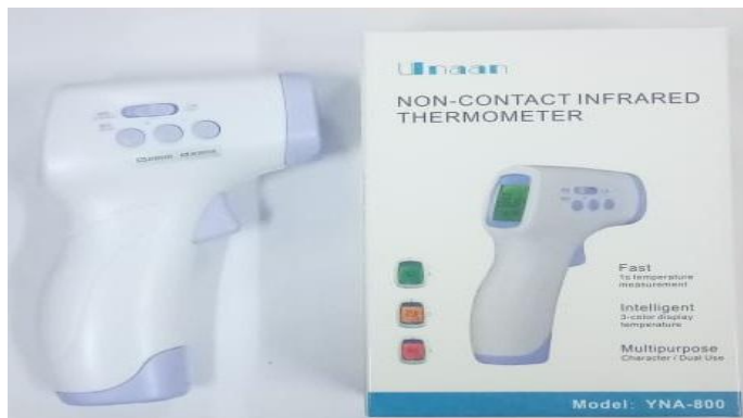
Infrared Thermometer Make: Ulnaan