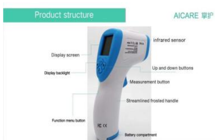
Infrared Thermometer Make: Aicare