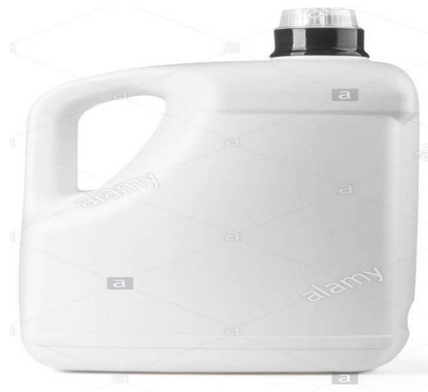
Hand Wash 5 Ltr

Unit/Pack– 1 KG, 5 KG, 20 KG, 60 KG, 50KG