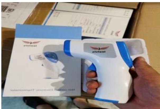
Infrared Thermometer Make: Leelvis