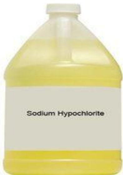
Sodium Hypo. Chloride

Unit/Pack– 1 KG, 5 KG, 20 KG, 60 KG, 50KG