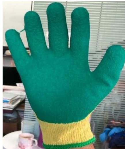
Cut Resistance Hand Gloves