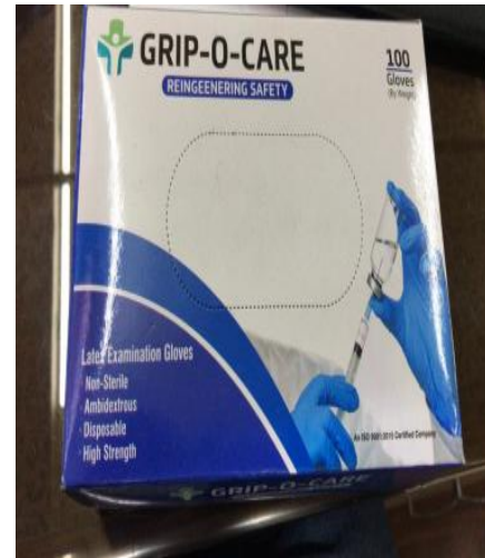
Surgical Hand Gloves