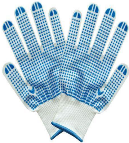
Dotted Hand Gloves