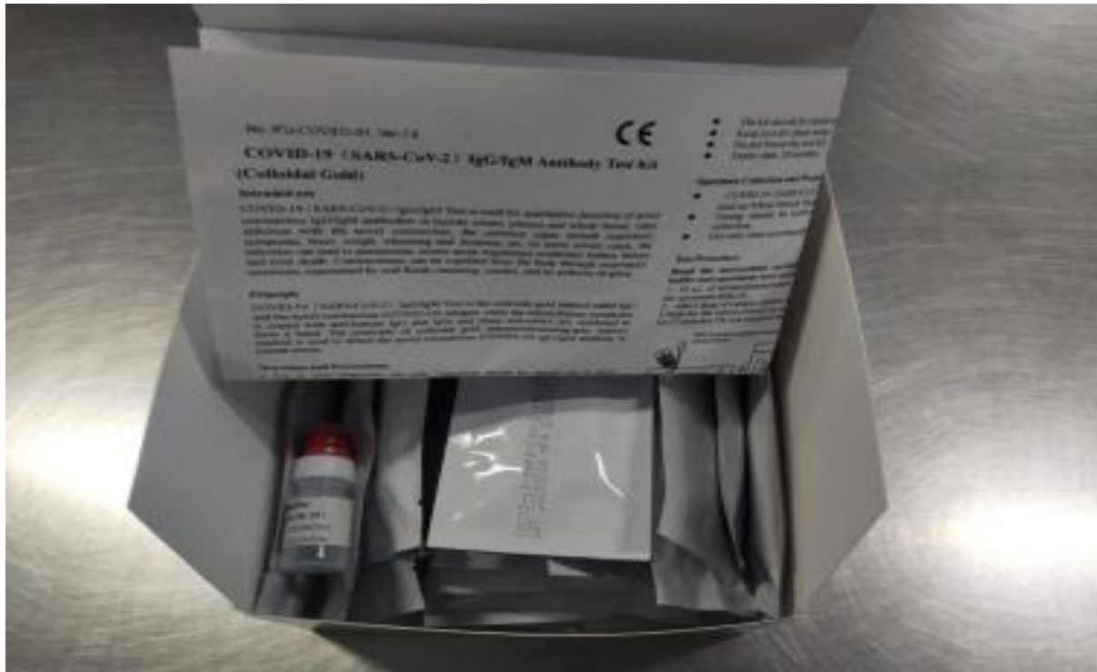
COVID-19 Testing Kit