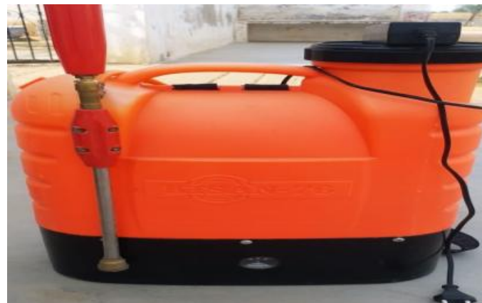
Spray Pump-12 Wt Battery Operated (15 Ltr)