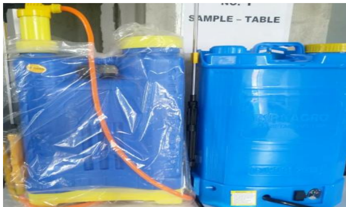
Spray Pump-Manual & Battery Operated (7 Wt) - (15 Ltr)