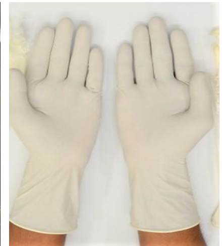
Rubber Hand Gloves