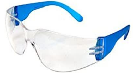
Safety Goggle (Over spectacle)